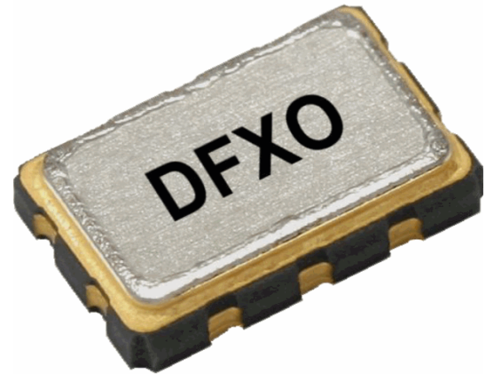
Outline (mm) -SM1 = (Gold plated, RoHS compliant)