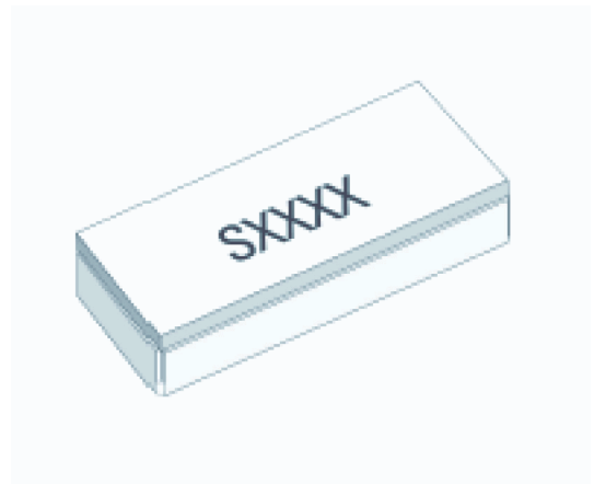
Outline (mm) -SM1 = Gold plated (RoHS)